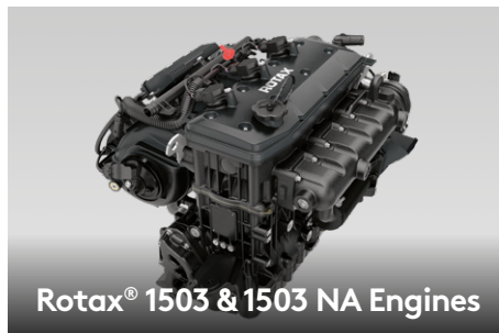
Rotax® 1503 & 1503 NA Engines

Allows riders to easily find the ideal trim setting for different water conditions.