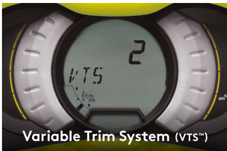
Variable Trim System (VTS™)

Makes boarding from the water easier and quicker.