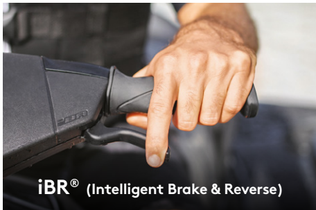
iBR® (Intelligent Brake & Reverse)

Exclusive to Sea-Doo®, iBR® stops the watercraft sooner and provides more control and maneuverability at low speeds and in reverse.