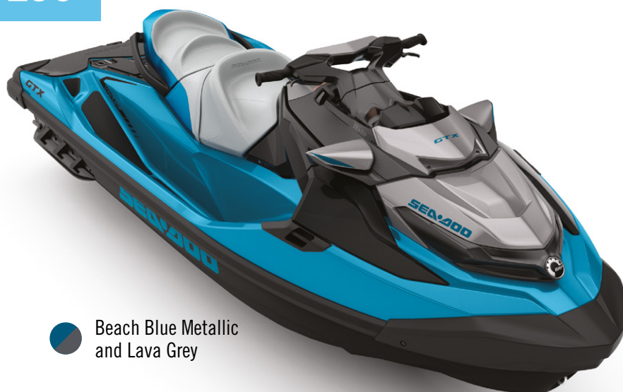
Beach Blue Metallic and Lava Grey